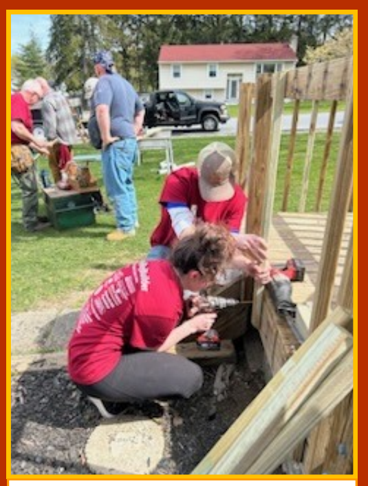
The Dickeson family works on replacing old outside steps.